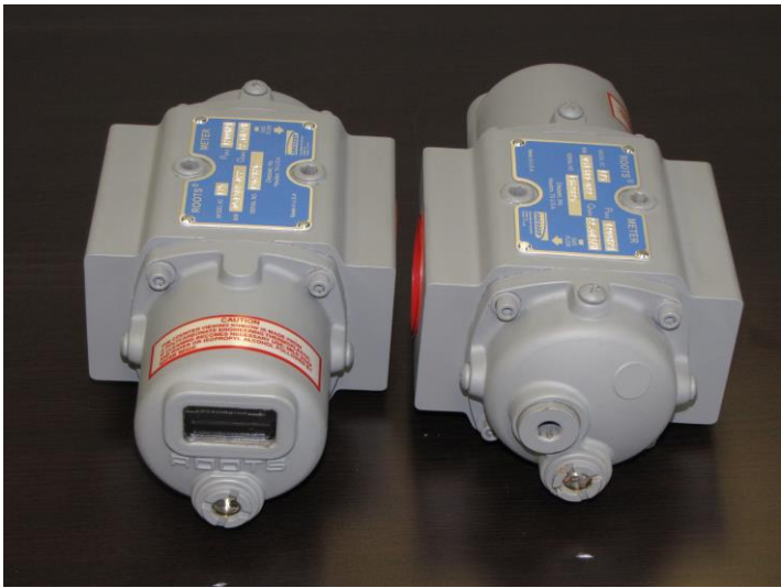
Position 2: Horizontal/Left to Right