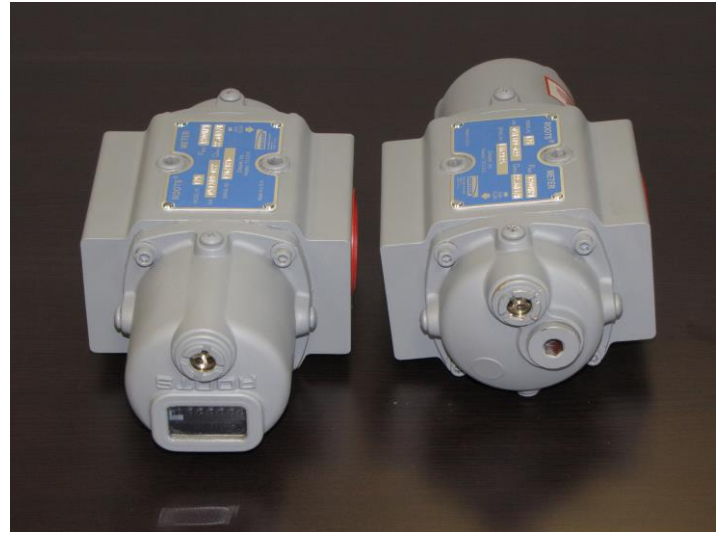
Position 3: Upside Down Horizontal/ Right to Left