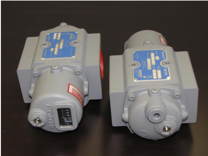
Position 1: Opposite of Normal/ Vertical Up