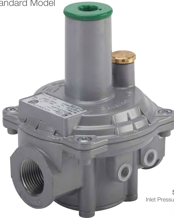
Standard Model Inlet Pressure Range: 3" W.C. to 2 PSIG